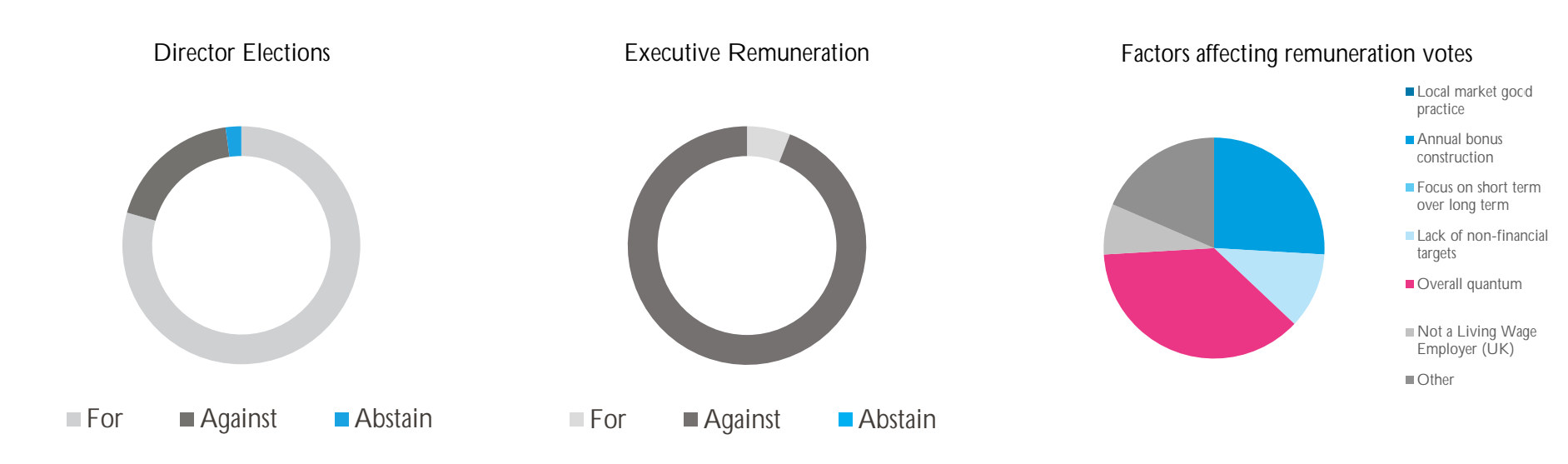
Chart 2. CCLA Vote by theme

We aim to support all pro-active shareholder proposals, and in Q1, added a dedicated voting pre-declaration section on our website. Our first pre-disclosed vote relates to a shareholder proposal at Nestlé, for 'an amendment to the Articles of Association regarding sales of healthier and less healthy foods', which we supported.